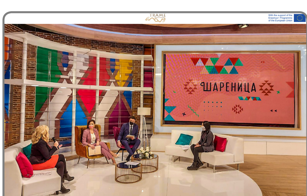
TRAME GUEST APPEARANCE AT ŠARENICA (NATIONAL TELEVISION OF SERBIA)

We would also like to use this opportunity to thank our friends from the media, above all the Original Magazine of the Novak Djokovic Foundation, the Archeostorie Magazine and the Radio Television of Serbia. Thank you for helping us spread the word about TRAME and sharing its values.